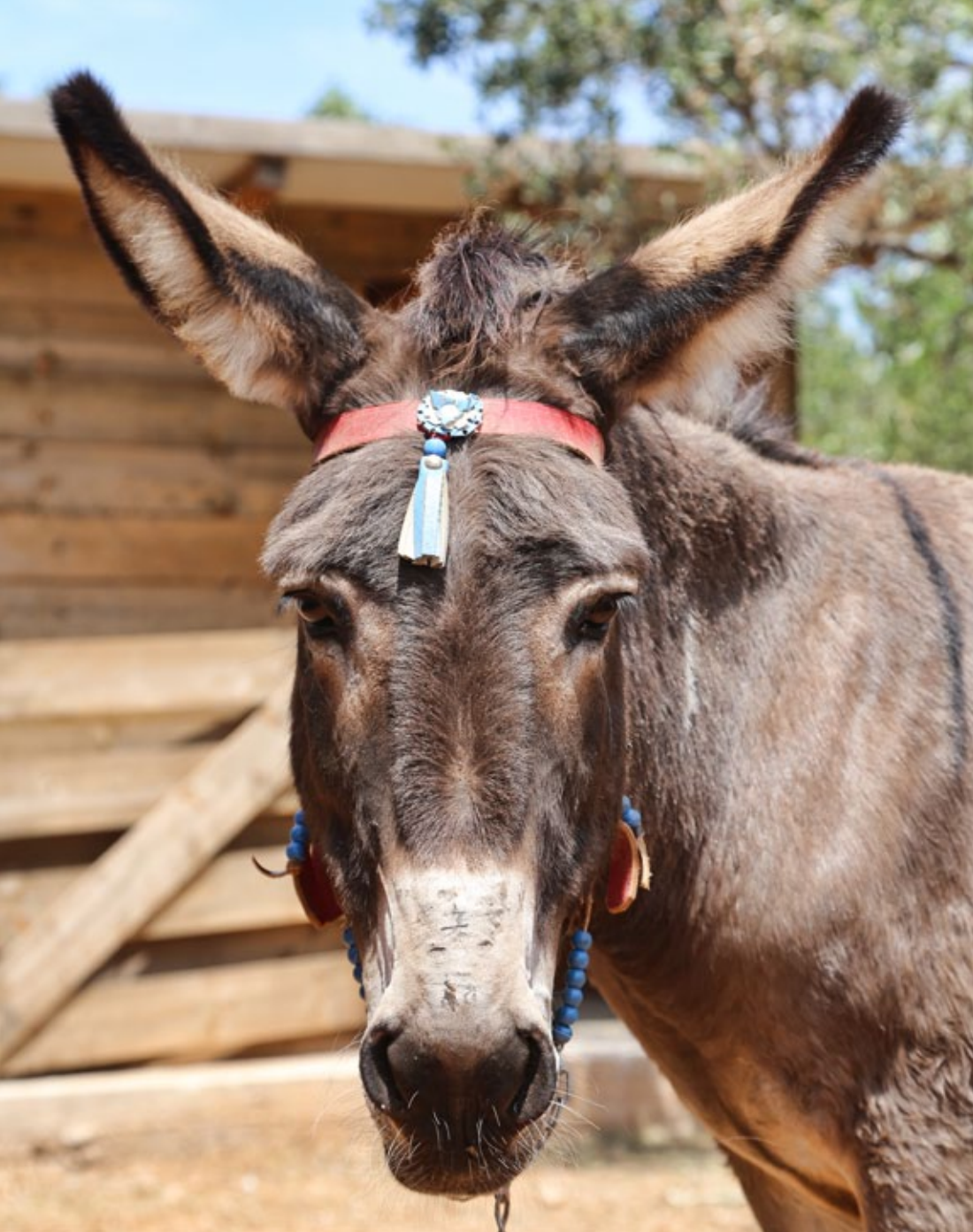
BILLY, OUR RESCUED DONKEY