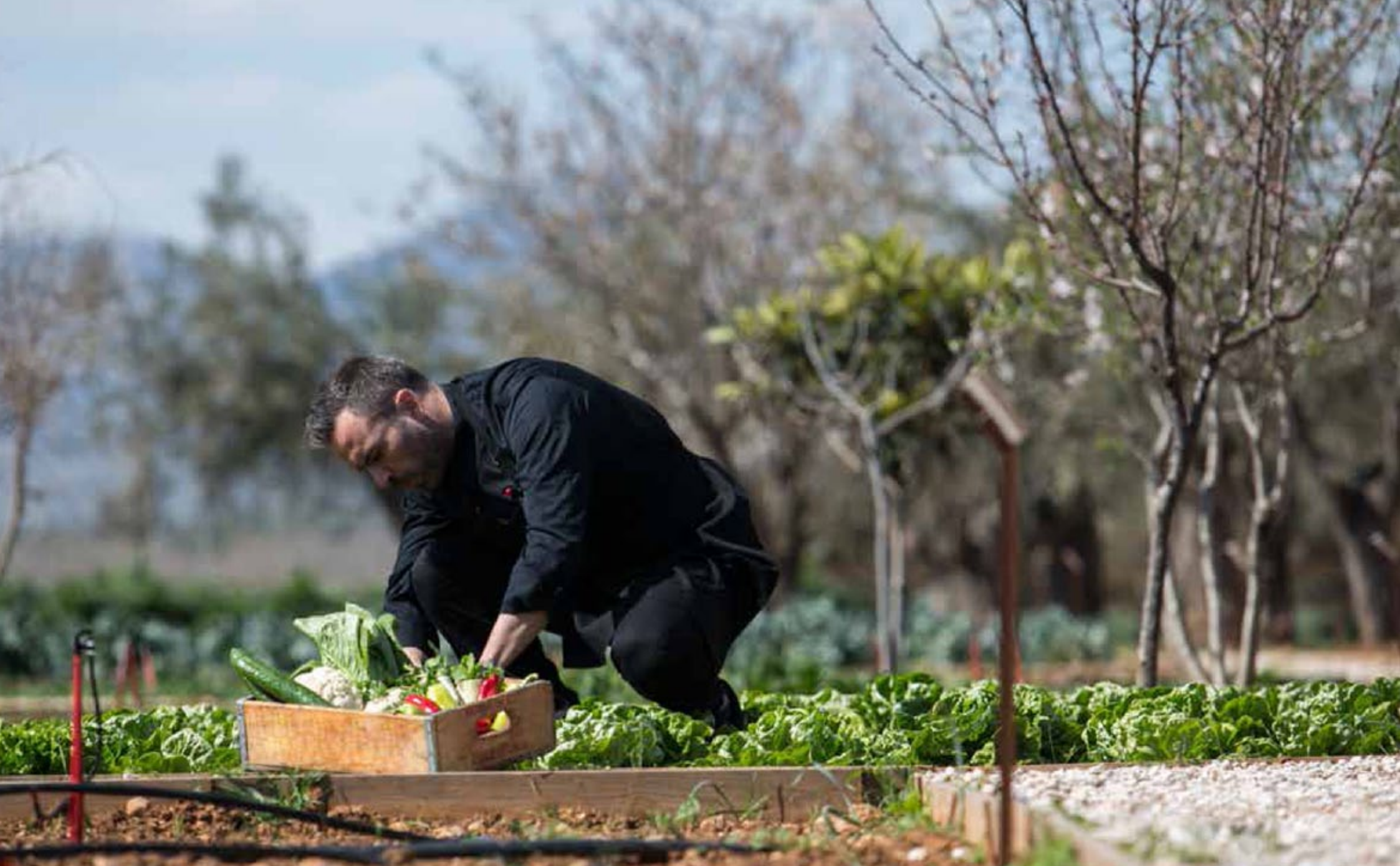
ORGANIC VEGETABLE GARDEN