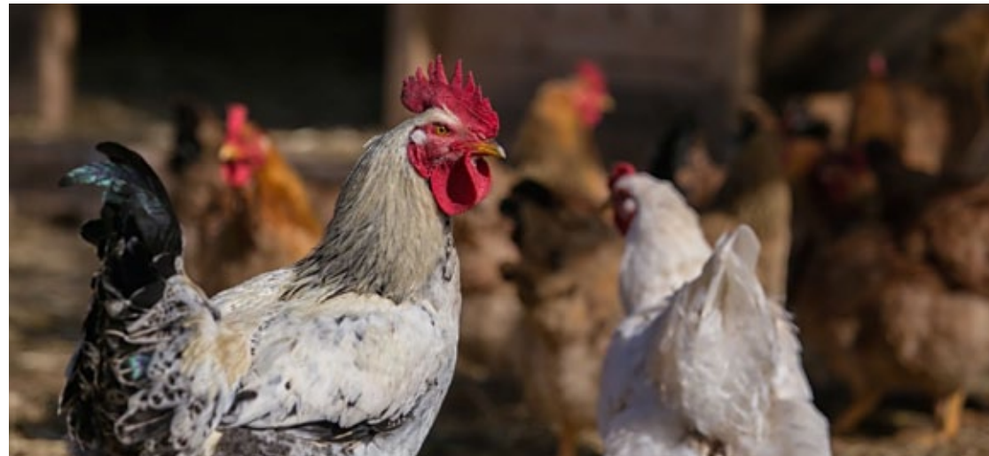
FEED THE ANIMALS!