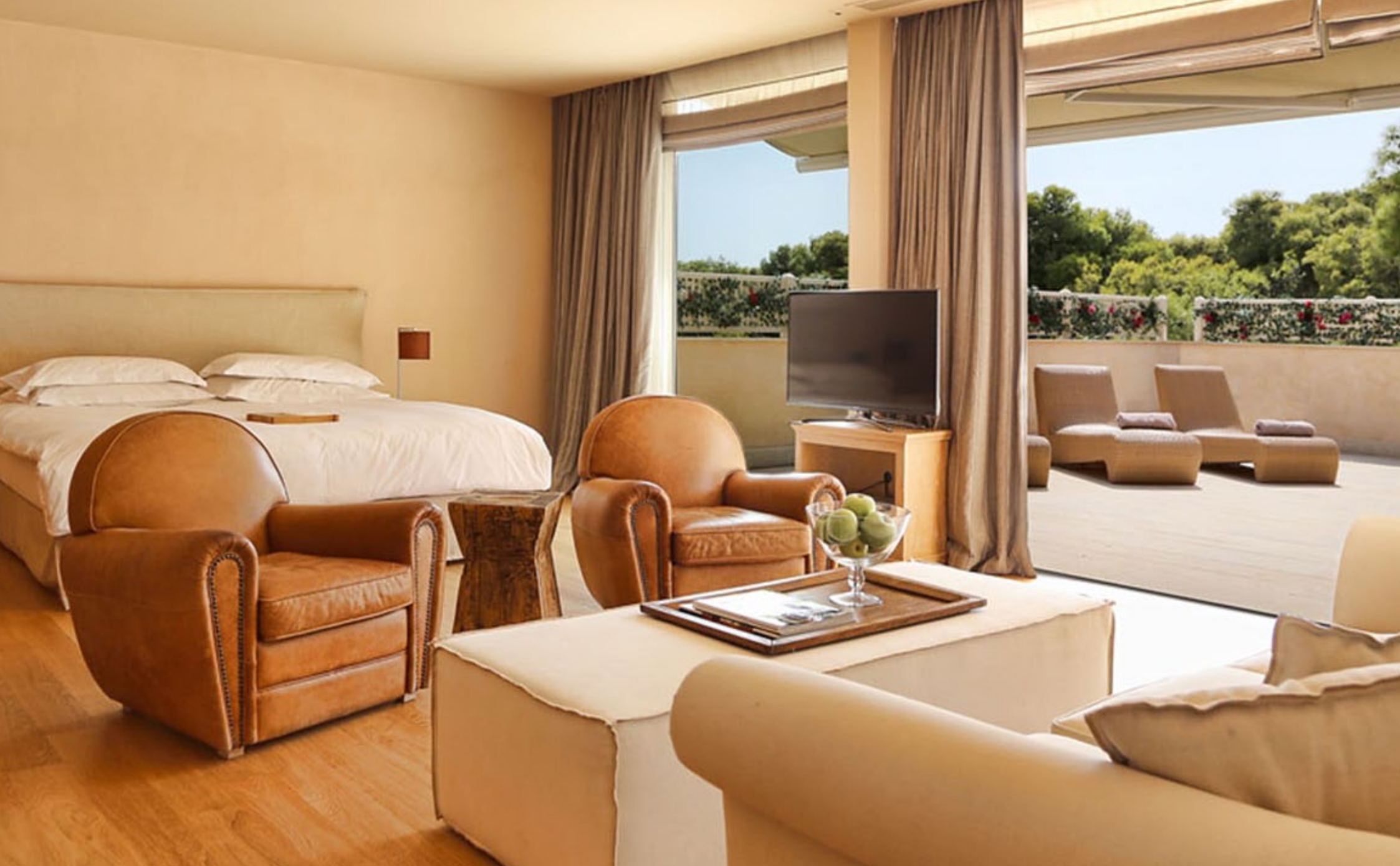
GRAND TERRACE SUITE